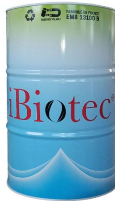
Drum 200 L