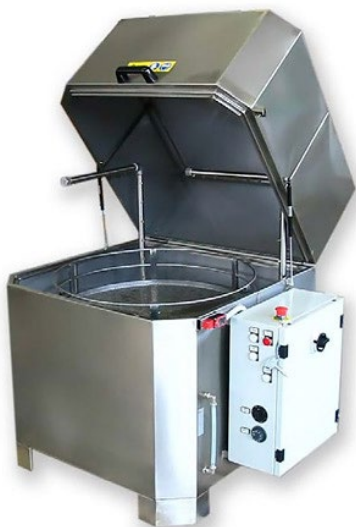
Rotating or forward-travelling basket