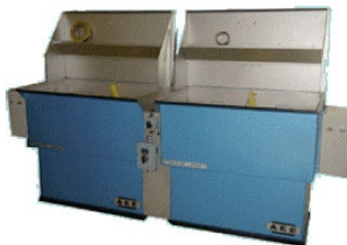
Hot or cold immersion tanks