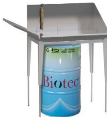
Solvent parts washers