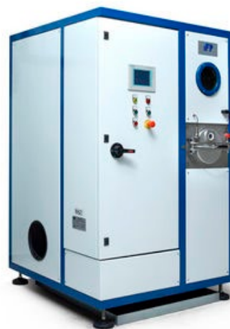
A3 washing machines

iBiotec® Tec Industries®Service Z.I La Massane - 13210 Saint-Rémy de Provence – France Tél. +33(0)4 90 92 74 70 – Fax. +33 (0)4 90 92 32 32 www.ibiotec.fr