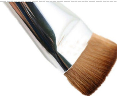
Degreasing with brush