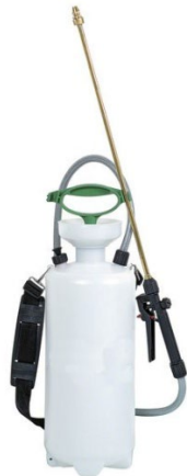
Low-pressure sprayers with water rinse