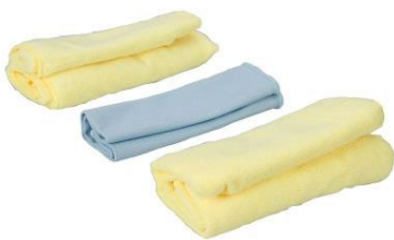
Degreasing with rag