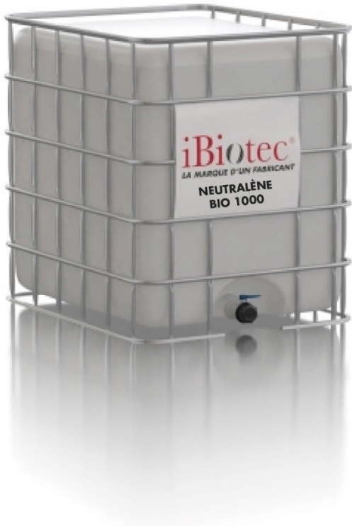
IBC GRV 1000 L